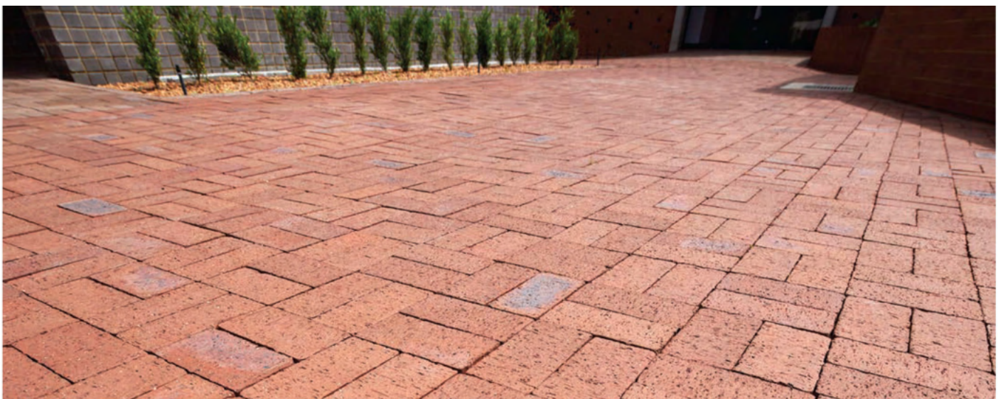
NWU Vaal Campus Admin Building | Architect - Mathews & Associates Architects

Download the high-resolution swatches, BIM files and view more project photos | www.corobrik.co.za