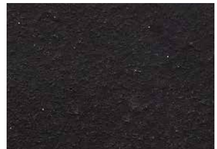
Black Brick Satin